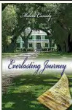
Everlasting Journey Time Travel Romance